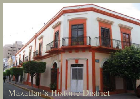
Mazatlán's Historic District