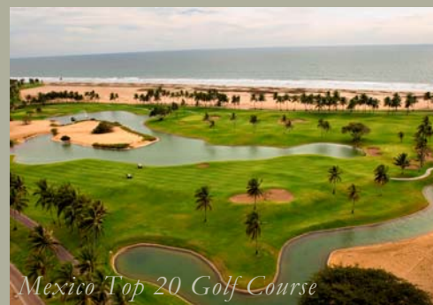
Mexico Top 20 Golf Course