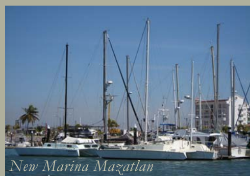
New Marina Mazatlán