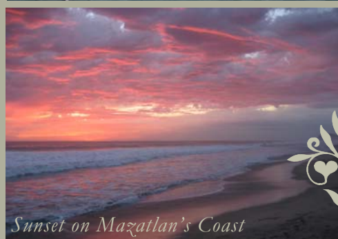
Sunset on Mazatlán's Coast

Mazatlan, historically called "the land of the deer", has over 4 centuries of history preserved in its architecture, traditions & culture. As an alluring mix of the old & new Mexico, Mazatlan is by far the best-kept secret on the Mexico's Pacific Coast.